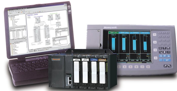
Figure 2: HC900 Hybrid Controller, Model 1042 OI and Hybrid Control Designer Software

Overview. The HC900 as shown in Figure 2 consists of a panel-mounted controller, available in 3 rack sizes along with remote I/O, connected to a dedicated Operator Interface (OI).