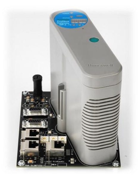
Figure 3. Honeywell's robust Experion C300 controller.

C300 Controller: The Experion C300 controller operates Honeywell's deterministic Control Execution Environment (CEE) software, which executes control strategies on a consistent and predictable schedule.