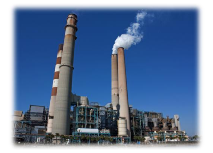
Figure 1. Electrical power producers are faced with a wide range of automation challenges.

A typical power plant has three main operational areas: boilers, turbines and balance-of-plant. Tight integration of these areas is crucial, especially as each has specific control requirements. For example, a boiler requires very precise proportional-integral-derivative (PID) control, whereas in the balance-of-plant area, control depends on the correct handling of discrete inputs/outputs.