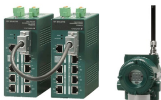
YFGW520 (Field Wireless Access Point) YFGW410 (Field Wireless Management Station)