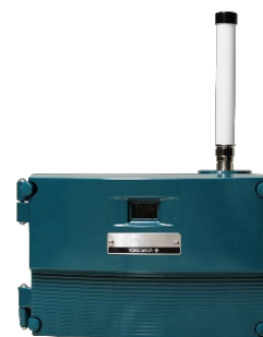
YTMX580 Multi-Input Temperature Transmitter